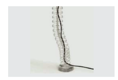
CABLE SPINE Ø 9 X 120 Union of grommets made by circular polycarbonate articulated rings, diameter 90 mm, which give great flexibility to accommodate quickly all types of cables. It can be screwed or clipped to a tray and the ground with a metal pedestal base.