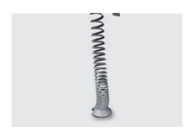
CABLE SPINE Ø 9 X 120 Grommet set made of ø 90 mm circular ABS rings. It applies to all types of hight thanks to its extendable spring. It is screwed in the desk top.