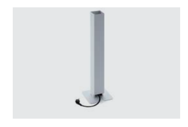
METAL CABLE PILLAR 1,5 mm thick metal pillar. Section 71 x 70 mm, base 160 x 160 mm. Overall height 572.5 mm.