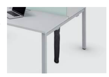
FABRIC CABLE RISERS Fabric cable riser, made of Web mesh and 80 mm diameter. Fixed by an elastic band.