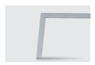
SINGLE CABLE MANAGEMENT FROM THE LEG FRAME 1 mm thick folded sheet metal column in "C" shape. 31,5 x 38,2 mm and 584 mm height. Fixation to leg by pressure.