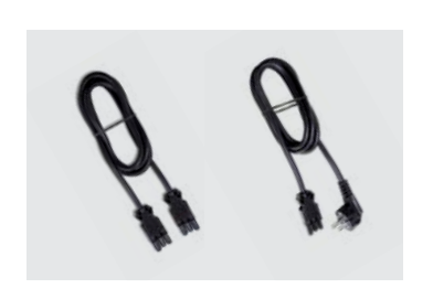
POWER CABLE AND EXTEN-SION CABLE 3 x 1,5 mm<sup>2</sup> cable 250V 16A with grounding.