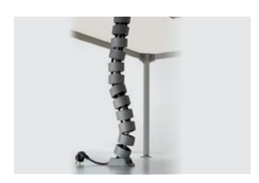
CABLE SPINE FOR ELECTRIFICATION Spiral thermoplastic material, anchored to the top by screws and to the ground with a pedestal base. Silver gray finish.