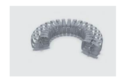
CABLE SPINE 4 x 5 x 8 cm Articulated and removable rings, which can be added or removed easily, allowing the desired length at each facility. Easier attachment. Made of polycarbonate. The flexibility of its parts provides a pivotal movement in all directions.