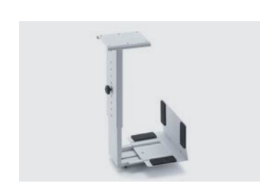
ADJUSTABLE CPU CABINET Support folded metal sheet, 2 mm thick. Adjustable height and width to suit different dimensions. Screwed to desk top. Flexible polyurethane protections to prevent vibration and to ensure an optimal fit.